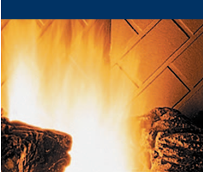
FREESTANDING PELLET STOVE BY ENVIRO®